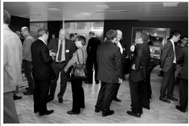
Avatech International Conferences

On November 16 th and 17 th 2010 Avatech will be hosting an International U2 Conference event in Switzerland for its customers.