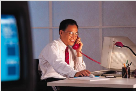
New support standards for customers